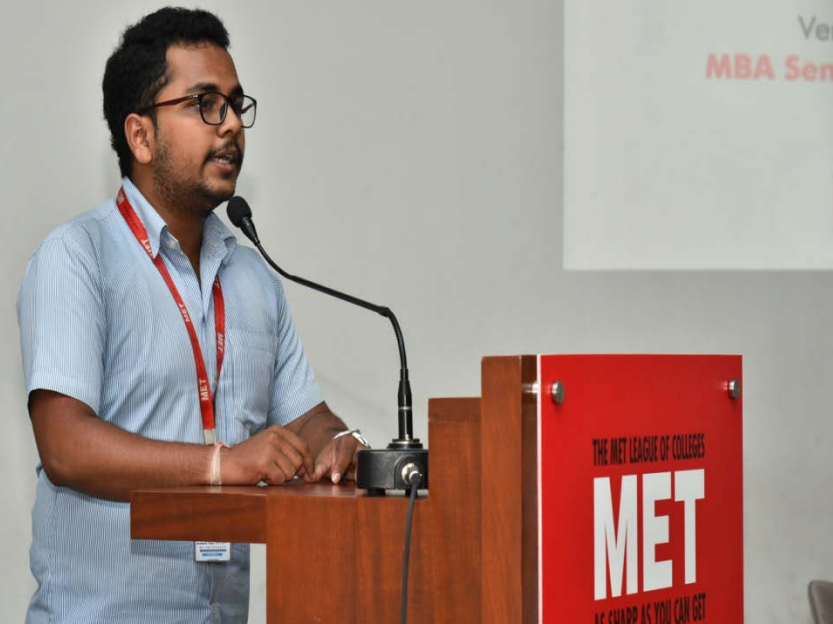
Students sharing their experience of Department