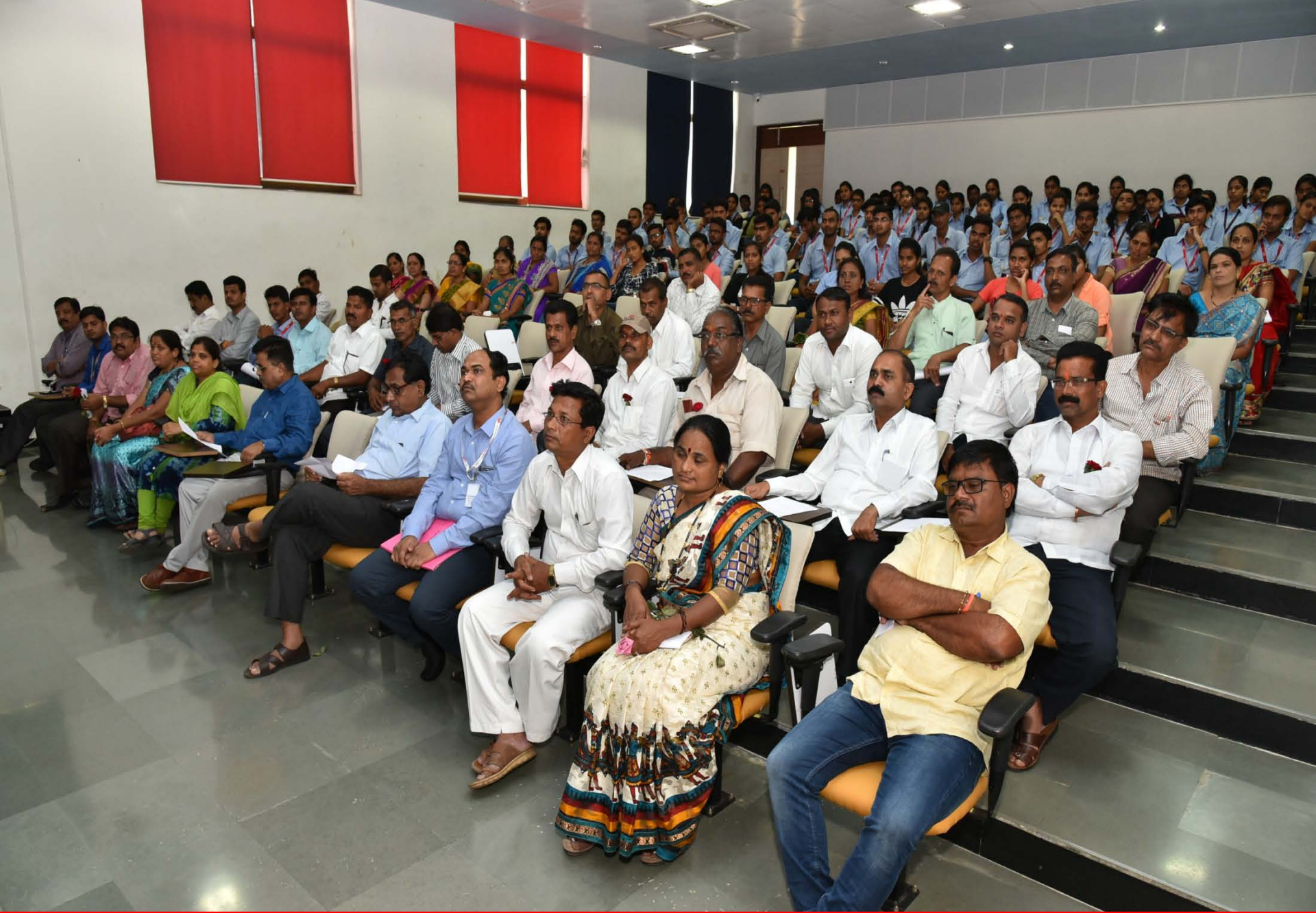
Parent & Students