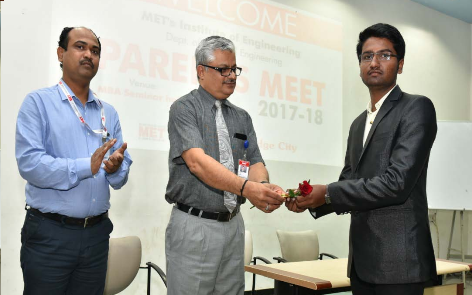
Felicitations of Toppers