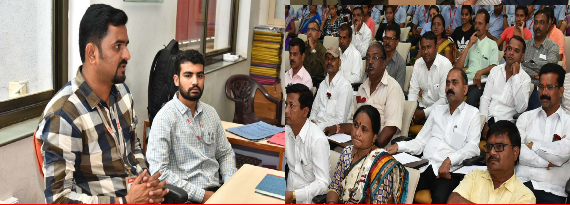
Discussion of Parents with Class Coordinators